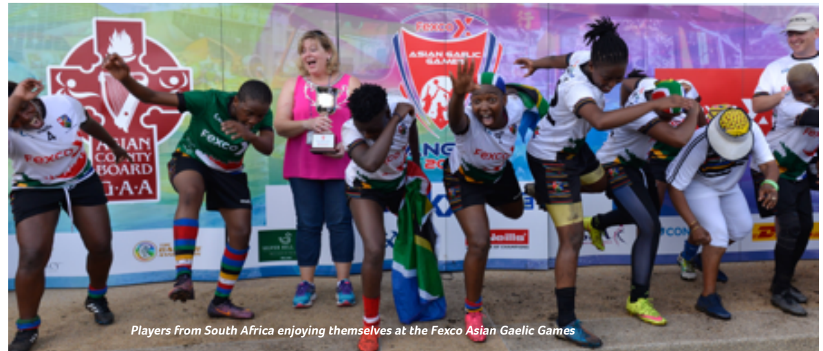
Players from South Africa enjoying themselves at the Fexco Asian Gaelic Games

With more than 35 different nationalities playing over the weekend at the games – we can faithfully say that Gaelic sport has become a global sport. The Asian County Board looks forward to 2019 in the wonderful city of Kuala Lumpur where the games will be organized by the local Club Orang Éire.