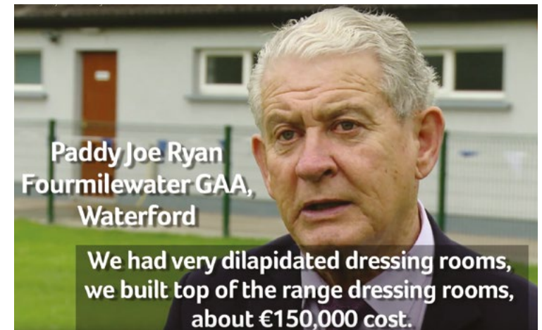
Fourmilewater in Waterford now have outstanding facilities