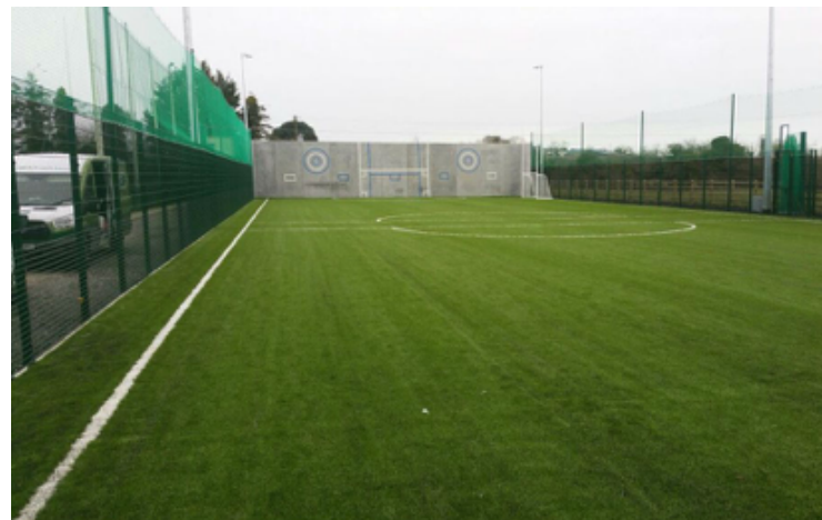
Clubs can access grants from Croke Park to improve facilities