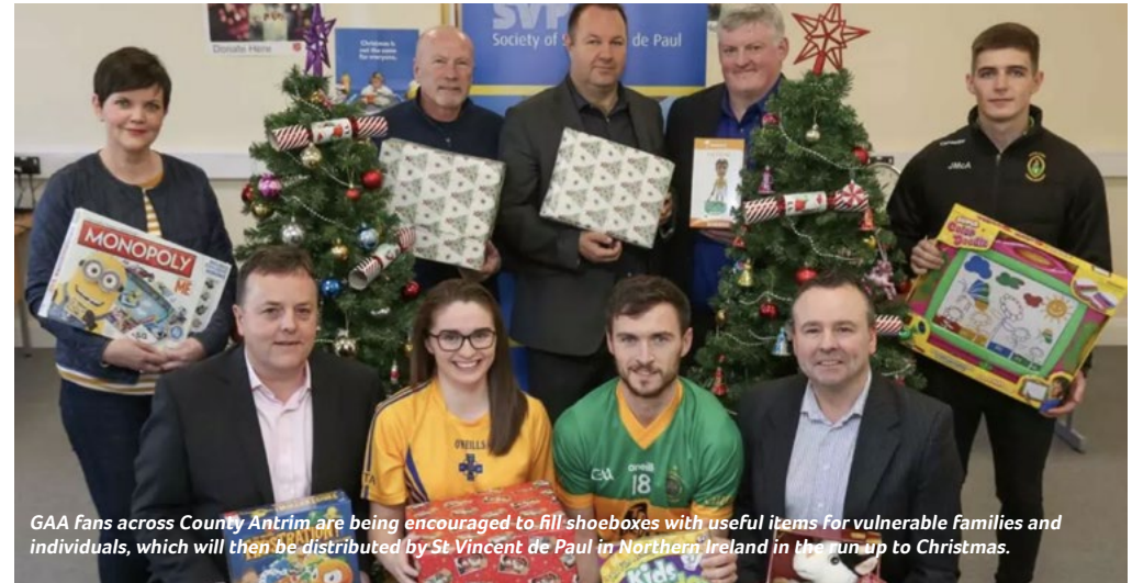
GAA fans across County Antrim are being encouraged to fill shoeboxes with useful items for vulnerable families and individuals, which will then be distributed by St Vincent de Paul in Northern Ireland in the run up to Christmas.

"It's very simple to make a shoebox donation. The next time you're out shopping, pick up a few extra little items, place them in a shoebox, wrap the box and mark on it whether it is suitable for a man or woman. Suitable items for the shoebox could be things such as shower gel, toothbrushes, toothpaste, lip balm, gloves, hats, small towels, chocolate, hand cream, to name just a few. Or you can provide a new, unwrapped gift for child up to 16 years old – we are also keen to take more gifts for teenage boys this year. SVP will then collect all donations from your local GAA club."