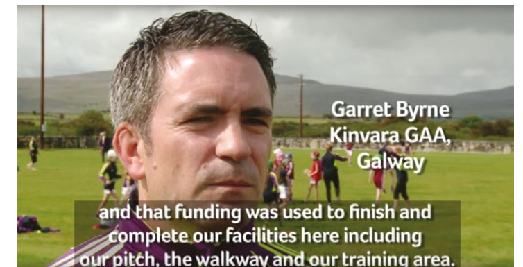
Kinvara in Galway are reaping the rewards of their hard work at redevelopment