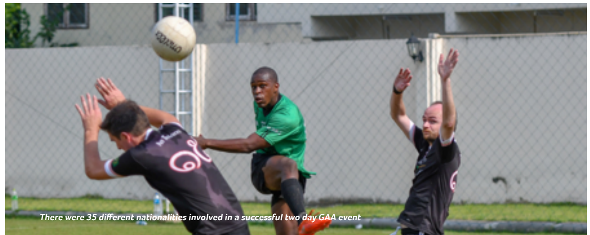
There were 35 different nationalities involved in a successful two day GAA event